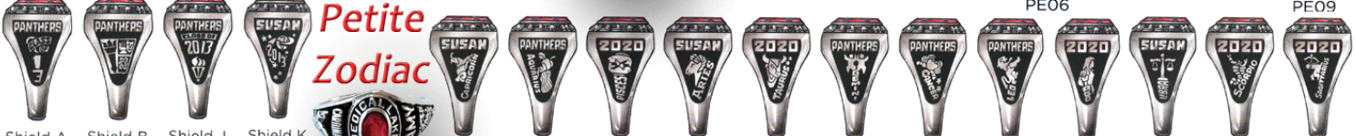
Shield A Shield B Shield J Shield K Capricorn PZ01 Aquarius PZ02 Pisces PZ03 Aries PZ04 Taurus PZ05 Gemini PZ06 Cancer PZ07 Leo PZ08 Virgo PZ09 Libra PZ10 Scorpio PZ11 Sagittarius PZ12