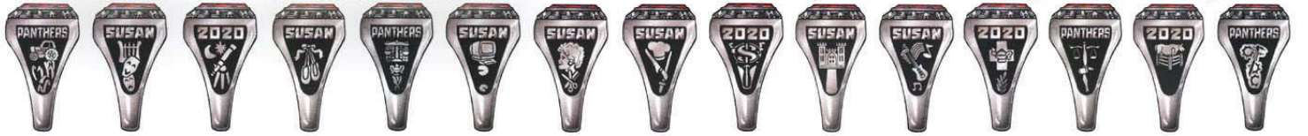
Agriculture PV02 The Arts PV03 Astronomy PV04 Ballet PV55 Business PV09 Computers PV12 Cosmetology PV13 Culinary Arts PV14 Dollar Sign PV56 Engineering PV18 Guitar PV23 Health PV24 Law PV28 Livestock PV30 Mechanical Eng. PV53

Select-a-Side Options (for the "Petite" style only #OP14)