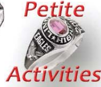
Academics PA01 Band A PA03 Band B PA48