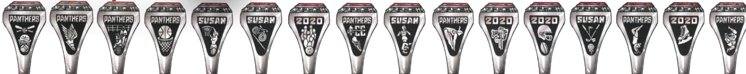
All Star PS01 Athletics PS02 Barrel Racing PS55 Basketball A PS04 Basketball B PS05 Biking PS06 Bowling PS09 Cross Country A PS10 Cross Country B PS11 Diving PS12 Equestrian PS52 Football PS14 Golf PS16 Gymnastics PS17 Ice Skating PS20 Judo PS22