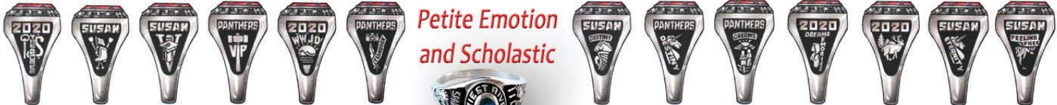
Treasurer PA39 Twirling PA40 Valedictorian PA41 Vice Pres. PA43 WWJD PA50 Yearbook PA44 Destiny A PEO3 Destiny B PEO4 Dreams PEO5 Dreams and Environmer PE06 Eternity PE08 Feeling Free PEO9