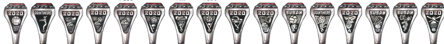
Volleyball PS43 Water Skiing PS46 Basketball/Track MSP01 Soccer/Basketball MSP02 Volleyball/Basketball MSP03 Volleyball/Softball MSP04 Basketball/Softball MSP06 Soccer/Softball MSP07 Swimming/Gymnastics MSP08 Cheerleader/Basketball MSP10 Volleyball/Track MSP12 Soccer/Track MSP11 Swimming/Softball MSP13 Volleyball/Cheerleader MSP14 Track/Cross Country MSP17 Basketball/Softball/Volleyball MSP18

All Class Rings come with a FULL LIFETIME WARRANTY. Resizing performed without charge. Replacing defective, broken or lost simulated birthstones. Restoring original finish. Your class ring graduation year (should your graduation date change) will be changed without charge. If your ring should be damaged beyond repair, it may be traded in on a new ring at a nominal charge. Should you change high schools before your graduation, we will change your crest on your current ring or manufacture a ring appropriate to the design of your new school. Precious and semi-precious stones, such as diamonds, are not covered under this warranty. This warranty does not cover expenses for LOSS or THEFT. This warranty is void if work is performed on your ring outside our facility. We cannot repair rings manufactured by other companies.