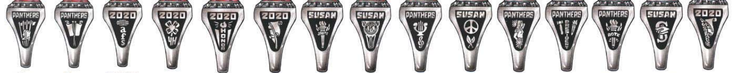
Flag Team A PA20 Flag Team B PA19 Foreign Exchange PA21 4-H PA22 Honor PA24 Journalism PA25 JROTC PA26 Key Club PA45 Music B PA29 Peace PA30 Pom Pon PA31 President PA32 ROTC PA33 Salutatorian PA35 Secretary PA37