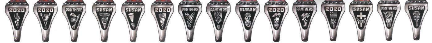
Baton A PA04 Baton B PA05 Cheerleader A PA06 Cheerleader B PA07 Cheerleader C PA08 Chorus PA09 Dance PA10 DECA PA51 Drama PA12 Drill Team A PA13 Drill Team B PA14 Ecology PA15 FCA PA17 FFA PA47 FHA PA18