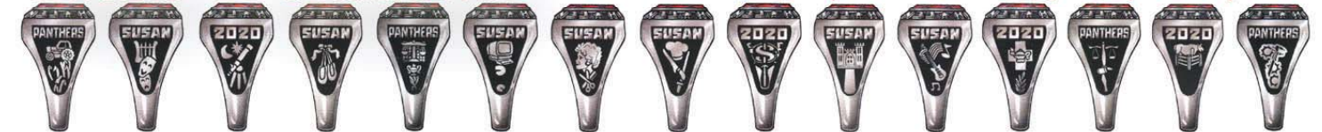
Agriculture PV02 The Arts PV03 Astronomy PV04 Ballet PV55 Business PV09 Computers PV12 Cosmetology PV13 Culinary Arts PV14 Dollar Sign PV56 Engineering PV18 Guitar PV23 Health PV24 Law PV28 Livestock PV30 Mechanical Eng. PV53

Select-a-Side Options (for the "Petite" style only #OP14)