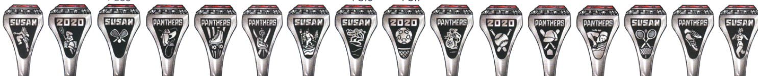
Karate PS23 Lacrosse A PS24 Lacrosse B PS25 Rodeo PS29 Roller Skating PS30 Skiing PS34 Cross Country Skiing PS59 Snowboarding PS50 Soccer A PS35 Soccer B PS51 Softball A PS36 Softball B PS37 Swimming PS39 Tennis PS40 Track A PS41 Track B PS42