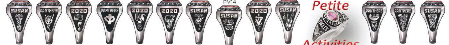
Nursing B PV35 Painting PV37 Photography PV39 Psychology PV43 Science PV45 Sheep PV51 USMC PV47 US Navy PV48 Veterinary PV49 Violin PV58 Academics PA01 Band A PA03 Band B PA48